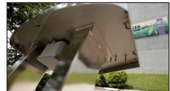
31 Route 66 Wayside exhibits are placed at sites with historic significance along the road in Illinois. Each exhibit tells the story of the site's relationship to Route 66. Some include audio on demand, playing on FlashAudio components supplied by Signal-Innova. Above, visitor presses a pushbutton to start the audio player housed in a NEMA 6P enclosure mounted under the panel. 6P is the highest protection rating against dirt, dust and water.