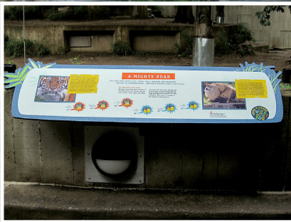
At the Smithsonian National Zoo, paths and trails lead to habitats such as Gibbon Ridge (top) featuring white-cheeked gibbons. Place your hand on a spot on the exhibit panel to hear the distant calls of apes. / At the Great Cats exhibit (left), Sumatran tigers and African lions roar on command with a touch of the exhibit panel. / Below, weatherproof mailboxes house FlashAudio components delivering bird sounds when a visitor opens a mailbox door.